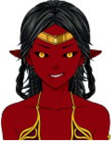
Žižeryx (The Infernal)