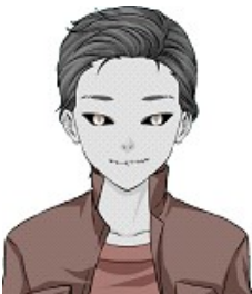
Garren (The Wisp) No sex scenes currently implemented