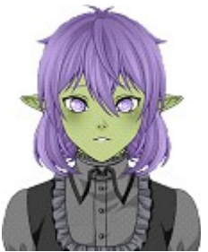
Issa (The Trap)

Fuck her ass: (+POTENCY) Dragon/Valzira Anal