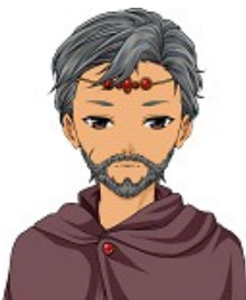
Malagar (The Warlock) No sex scenes currently implemented