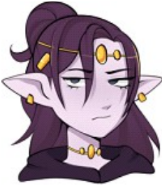
Valzira (The Witch)

After you claim the Abandoned Mine as your Lair, complete the Heist Quest and tell Žižeryx that Heloise is ready.