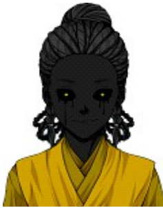
Mother (The Aberration)