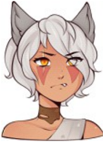
Naho (The Wolfgirl)