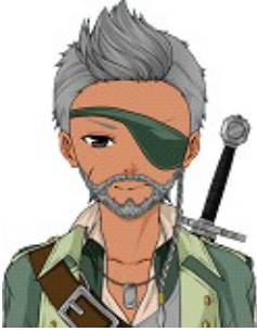
Rhyll (The Mercenary) No sex scenes currently implemented