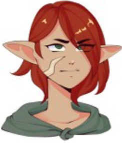
Maelys (The Huntress)