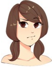
Chia (The Handmaiden)