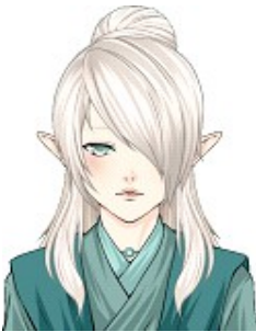
Heloise (The Inquisitrix)

After capturing Marie-Anne, rest for the night until you see a vision of the Farmstead.