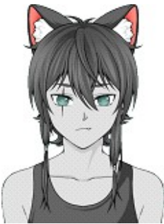
Eburon (The Wolfman) No sex scenes currently implemented