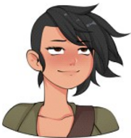
Cuchilla (The Drunk)

The Captives are women (and one Femboy) who you can capture and bring back to your lair for sex and other interactions. They can be gifted to your Hordes to increase morale and unlock special sex scenes, but doing so makes the Captives otherwise unavailable to you for the rest of the game. See the 'Hordes' section for their Horde sex scenes. Some scenes are only possible after learning their names, so be sure to talk to each after you capture them. Listed below are all the current Captives and their main erotic content. Note that certain actions will cause you lose a captive, making them unavailable for the rest of the game.