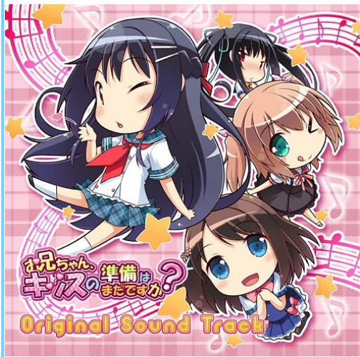
Original Sound Track

[Nirosari (Peeing Diary Code) Harem Release