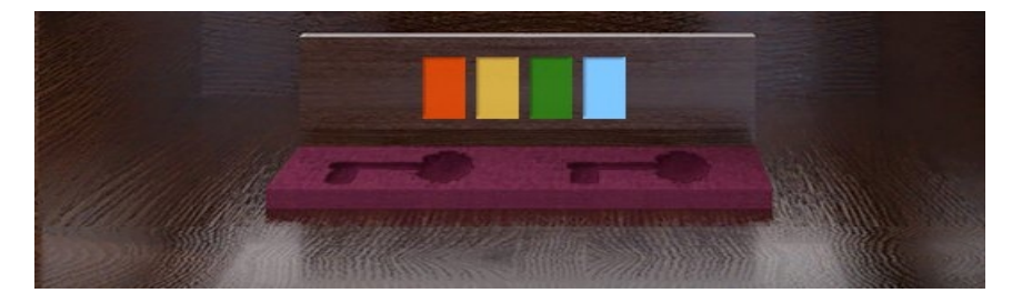
Using these examples, the hypothetical pass code would be: 1243

This is an example of the color code you might see, not the actual color code itself.